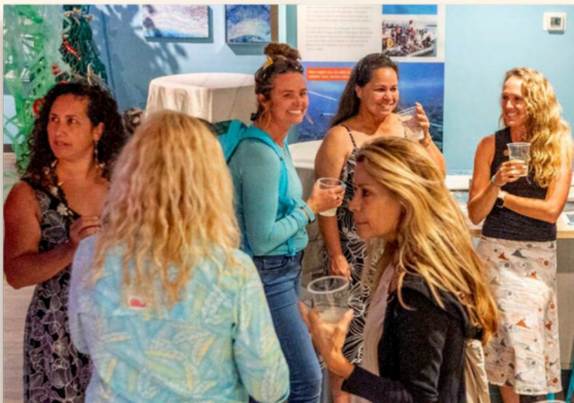
RENT THE DISCOVERY CENTER FOR YOUR EVENT!

Check out our Events page and visit us on Maui!