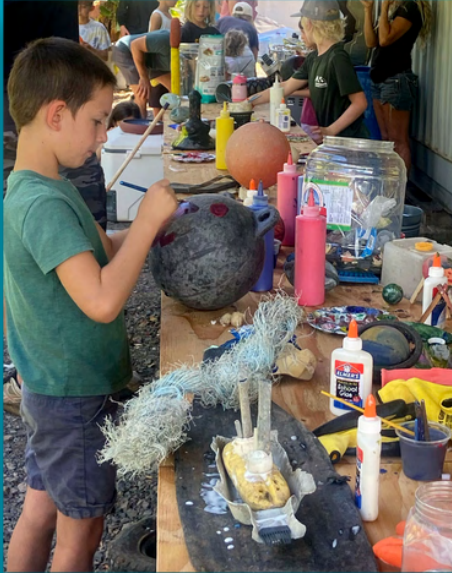
KIDS MAKING MARINE DEBRIS ART