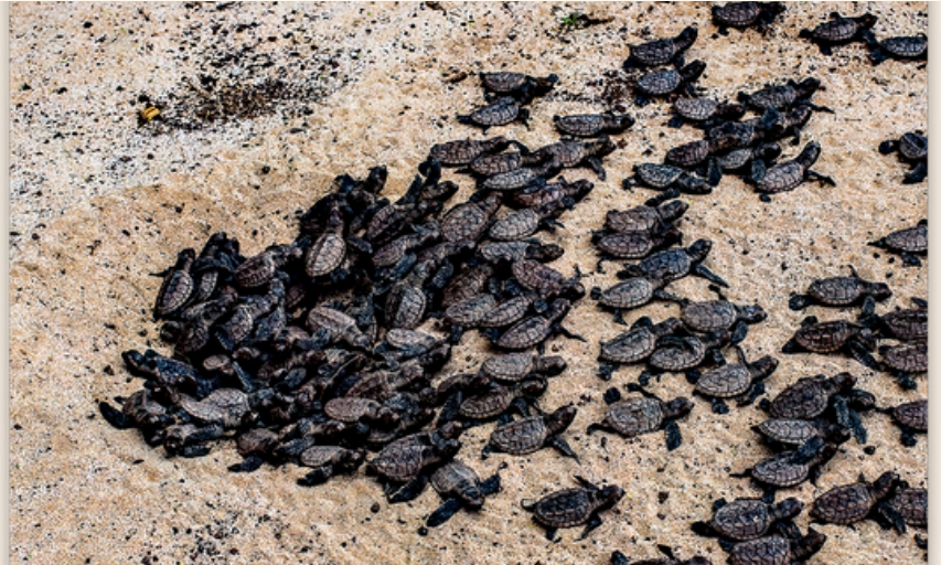
PHOTO OF HAWKSBILL HATCHLINGS