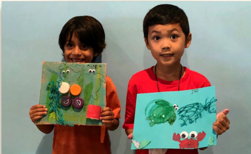
KEIKI SATURDAY ART CLASS AT HWDC